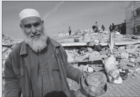
Palestinians in Gaza search the rubble of their homes for usable items after an Israeli air strike on Jan. 5, 2009.